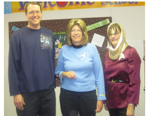
Three servant leaders from the planet Educattia beamed in to guide the crewmembers of the Starship Legacy.